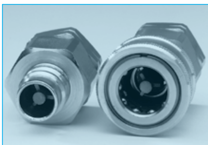
Female coupling with shut-off valve Male plug with shut-off valve

If both the housing and the male connector are the same diameter the following combinations can be used independent of material or connection: