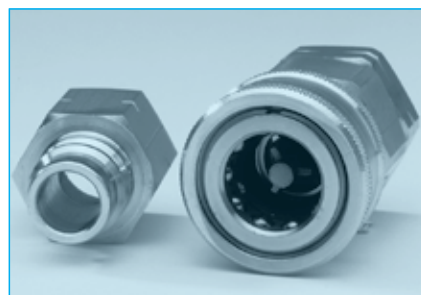
Female coupling with shut-off valve Male plug without shut-off valve