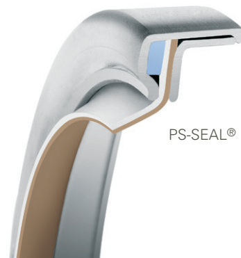
PS-SEAL® with reversed lip design